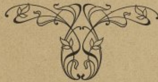
Table alphabétique des instruments etc., voir aux pages XXIII à XXXVIII, à la fin du même livre.

Table alphabétique des auteurs, avec les instruments respectifs en regard, voir aux pages IX à XXI du catalogue.