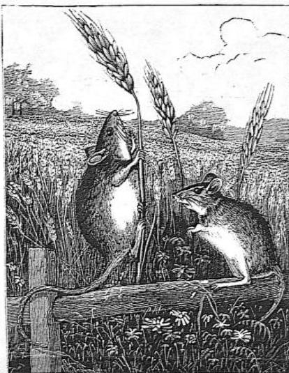
THE WHITE-FOOTED MOUSE, OR DEER MOUSE.

Let us suppose, in fact, that a photographic apparatus be set up on the road which is being traversed by a walker, and that we take the first image in a very short space of time. If the plate were to preserve its sensitiveness, we might, in an instant, take another image that would show the walker in another attitude in another point of space. This latter image, compared with the former, would exactly